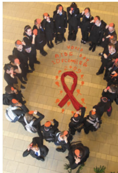
Students showing their support in the Awareness of World Aids

As part of the World Aids Day activities on 1 December, the lessons for the week in the PSHE department focussed on myths and facts about HIV, transmission of HIV and a general awareness of HIV and the situation around the world. An interesting fact: Currently there are more than 85 000 people in the UK living with HIV and a quarter of them have not been diagnosed.